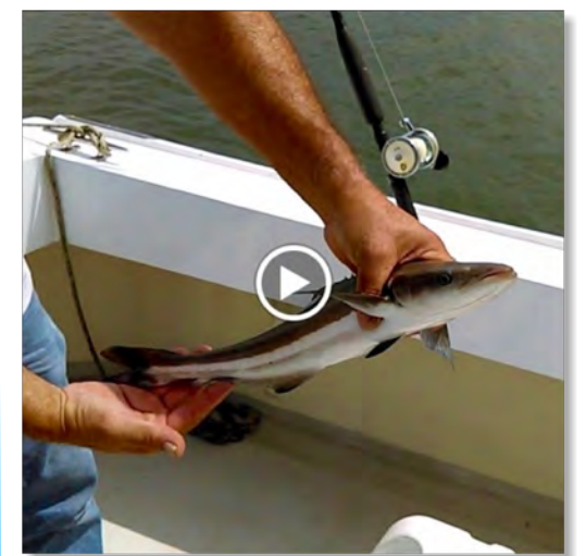
(Editor: JPEG thought it was a Video)

25 June: I went Cobia fishing with a few friends. We chummed on the flats in the bay outside the entrance to the York River. We had live Croakers and Crabs along with fresh frozen Bunker and Spot for bait and a fine chum slick of ground bunker and bunker oil that attracted most of the Sharks and Rays in the Chesapeake Bay. The only Cobia we caught was on a small rod we were using to trying and catch more bait . The smallest Cobia I ever saw.